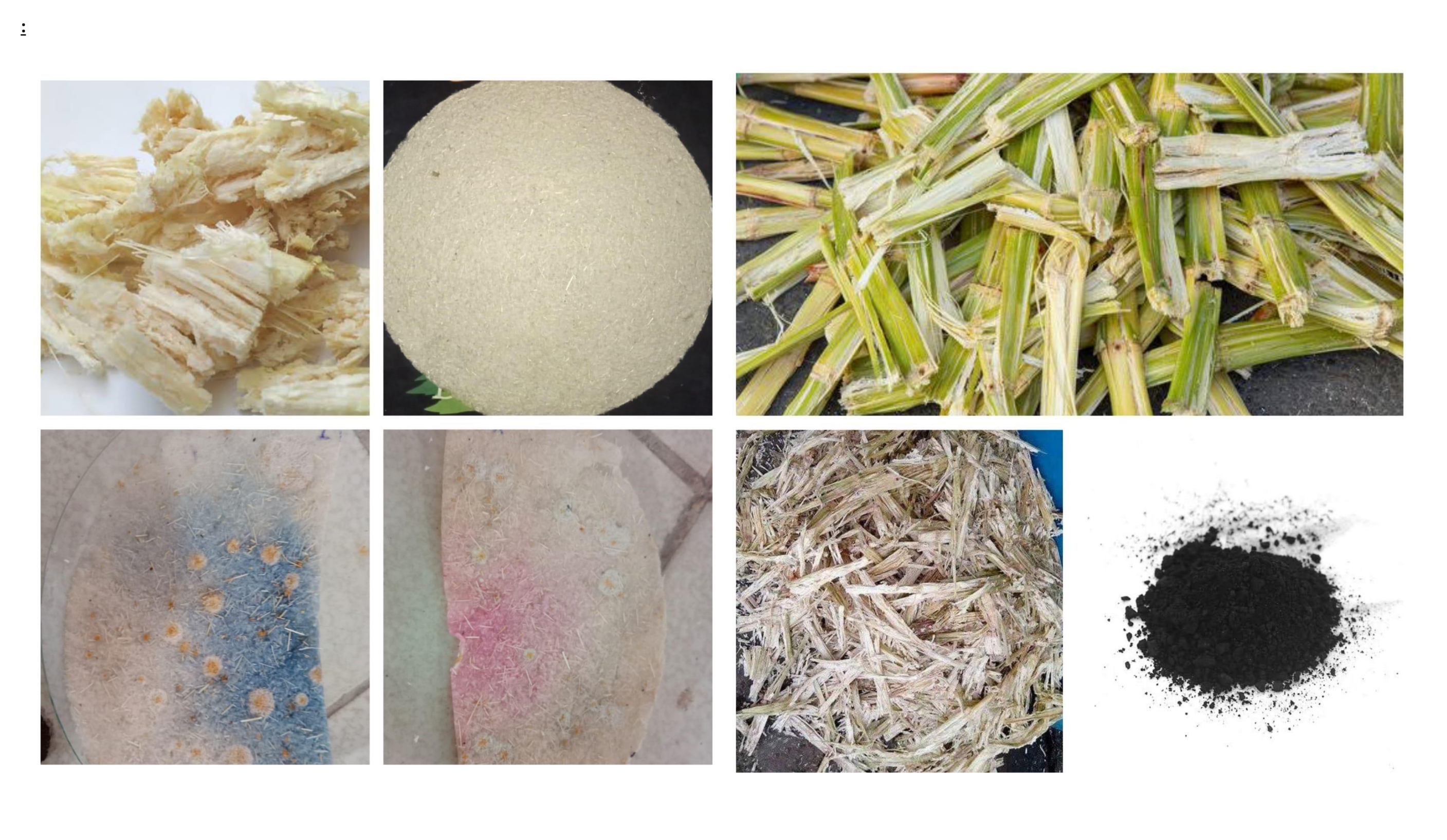
FILTER PAPER ADSORPTION

The dye wastewater is treated with bagasse charcoal powder. The water get purified after this eco-friendly and cost-effective treatment. The management of waste by product of sugarcane "BAGGASE" by filter paper production and formation of cost-effective bricks